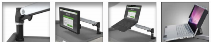
Ergotron LX® Mount Ergotron LX® LCD Mount Arm Ergotron® Notebook Tray Laptop Security Tray

Phoenix Series Medication Carts are reinforced and ready to accept the Ergotron LX on the left or right side.