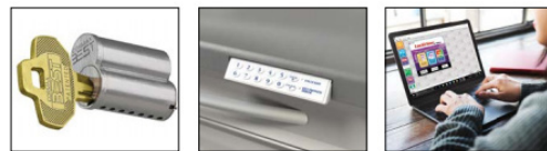
Central Lock Keyless Entry Pad Software Option

With multiple locking options and proven security you're sure to find the system that best fits your needs.