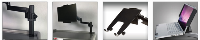
Monitor Arm Mount Kit Single Arm Monitor Mount Notebook Tray Laptop Security Tray

Phoenix Series Medication Carts are reinforced and ready to accept the Ergotron LX on the left or right side.