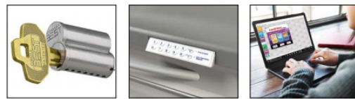
Central Lock Keyless Entry Pad Software Option

With multiple locking options and proven security you're sure to find the system that best fits your needs.