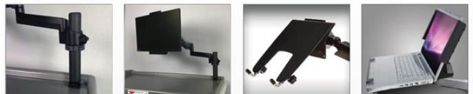
Monitor Arm Mount Kit Single Arm Monitor Mount Notebook Tray Laptop Security Tray

Phoenix Series Medication Carts are reinforced and ready to accept EMAR on the left or right side.