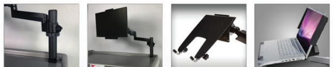
Monitor Arm Mount Kit Single Arm Monitor Mount Notebook Tray Laptop Security Tray

Phoenix Series Medication Carts are reinforced and ready to accept the Ergotron LX on the left or right side.