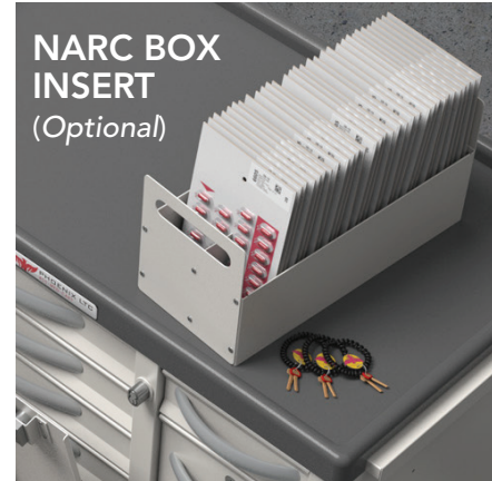
NARC BOX INSERT (Optional)