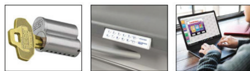
Central Lock Keyless Entry Pad Software Option

With multiple locking options and proven security you're sure to find the system that best fits your needs.