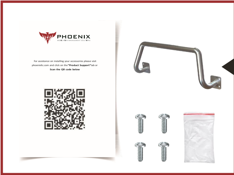
P-HRHANDLE (Alum Cart Handle)