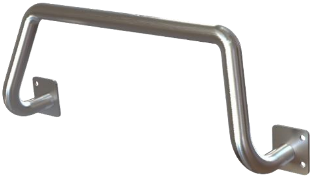
A17338 Cart Handle Assembly